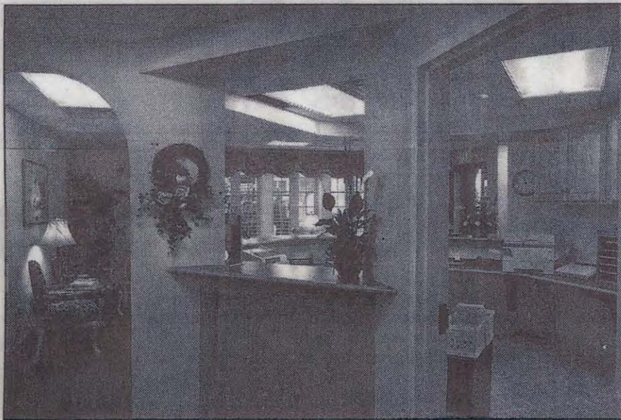
The interior of the reception area in the chiropractic clinic echoes the French country look of the building's exterior.

People "often lived above the store," he said. "This is a suburban version of what used to happen in a town or a city."